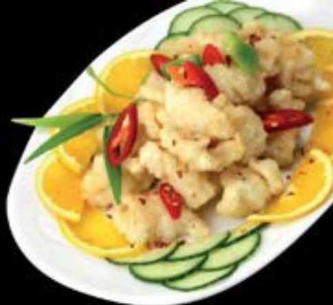
Salt & Pepper Squid