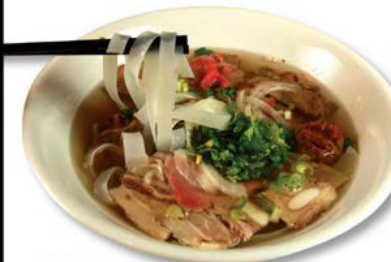
Special Noodle Soup