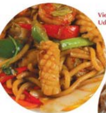
Vietnamese Seafood Stir Fried Udon Noodle