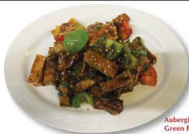
Aubergine, Tofu & Green Pepper in Black Bean Sauce