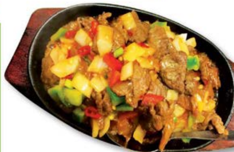
Sizzling Beef Garlic & Chilli