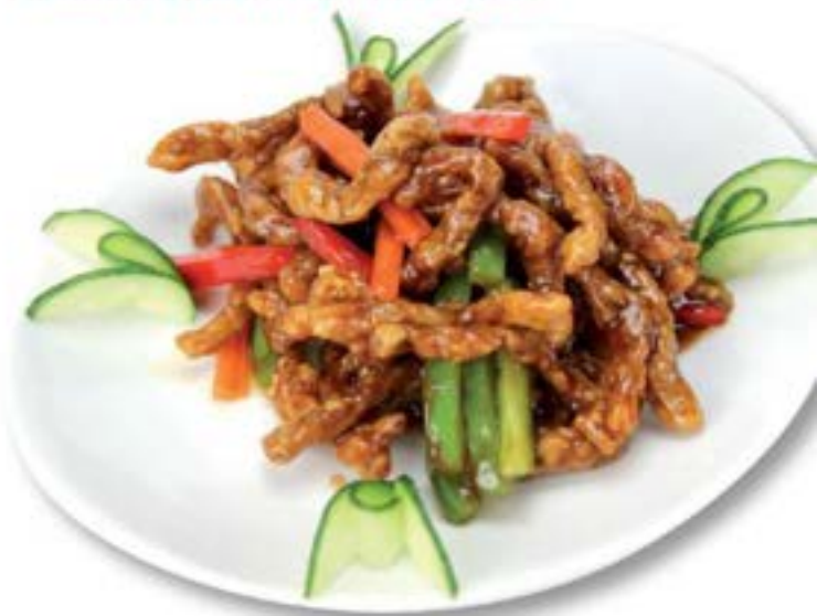
Shredded Crispy Beef in Spice & Chilli Sauce