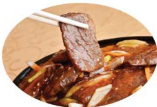
Sizzling Fillet Steak Cantonese Style