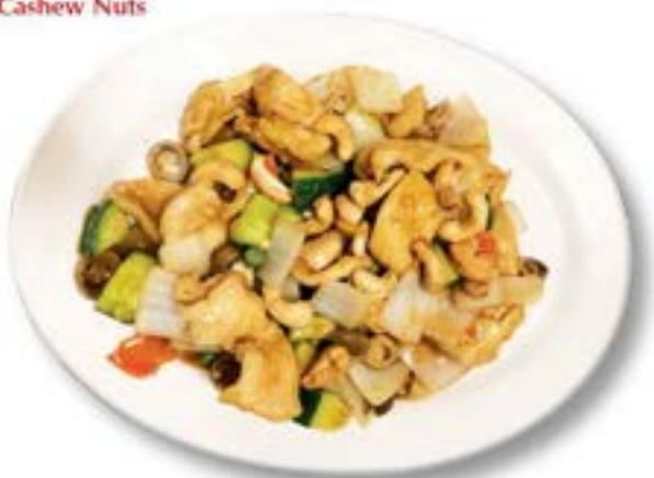
Chicken Cashew Nuts