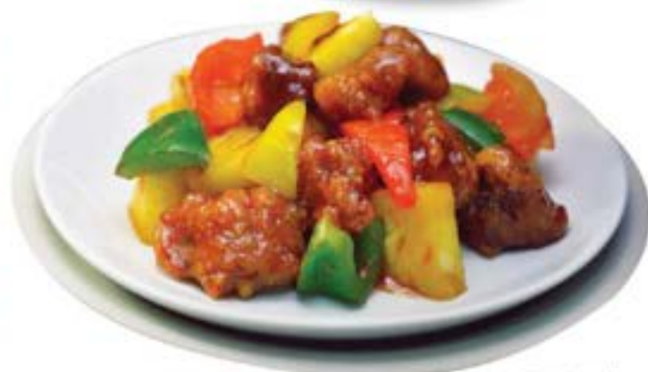
Sweet & Sour Pork

Some of our dishes contain ingredients which some people may have a reaction to. Please inform our staff before ordering if you suffer from any food allergies. We will do our best to advise you.