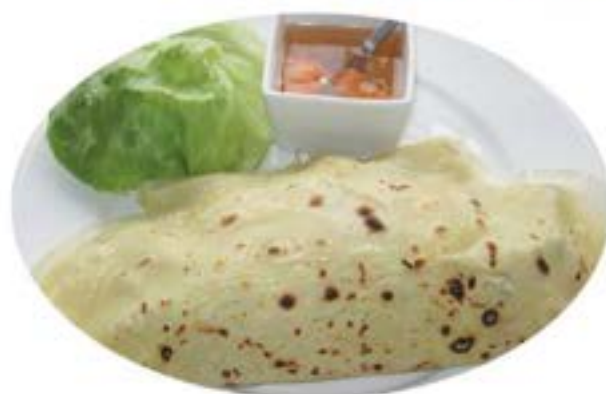
Vietnamese Pan Fried Pancake with King Prawns

Some of our dishes contain ingredients which some people may have a reaction to. Please inform our staff before ordering if you suffer from any food allergies. We will do our best to advise you.