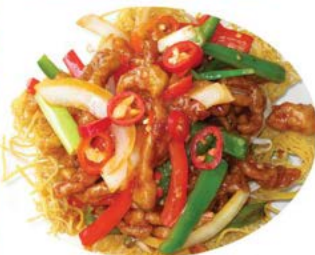
Shredded Crispy Beef in Spice & Chilli Sauce

Some of our dishes contain ingredients which some people may have a reaction to. Please inform our staff before ordering if you suffer from any food allergies. We will do our best to advise you.