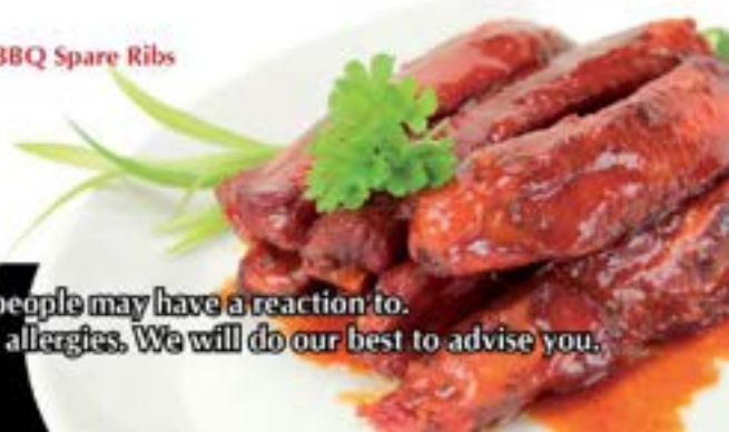
BBQ Spare Ribs

Some of our dishes contain ingredients which some people may have a reaction to. Please inform our staff before ordering if you suffer from any food allergies. We will do our best to advise you.