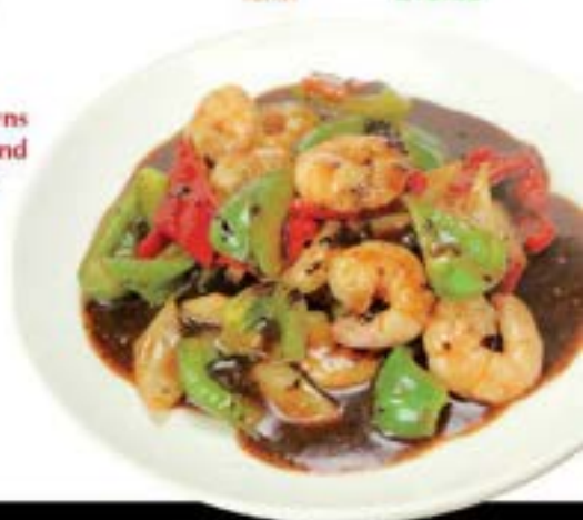
Sizzling King Prawns in Green Pepper and Black Bean Sauce

Some of our dishes contain ingredients which some people may have a reaction to. Please inform our staff before ordering if you suffer from any food allergies. We will do our best to advise you.