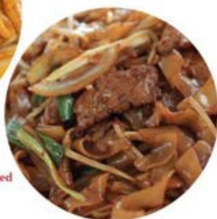
Chinese Style Beef Stir Fried Flat Rice Noodle