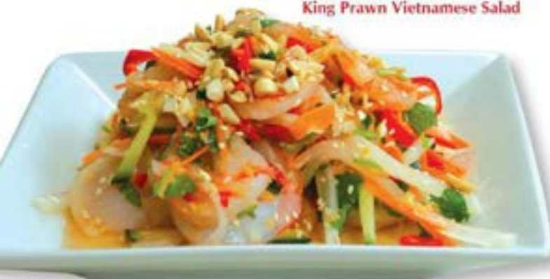
King Prawn Vietnamese Salad