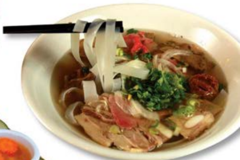
Special Noodle Soup