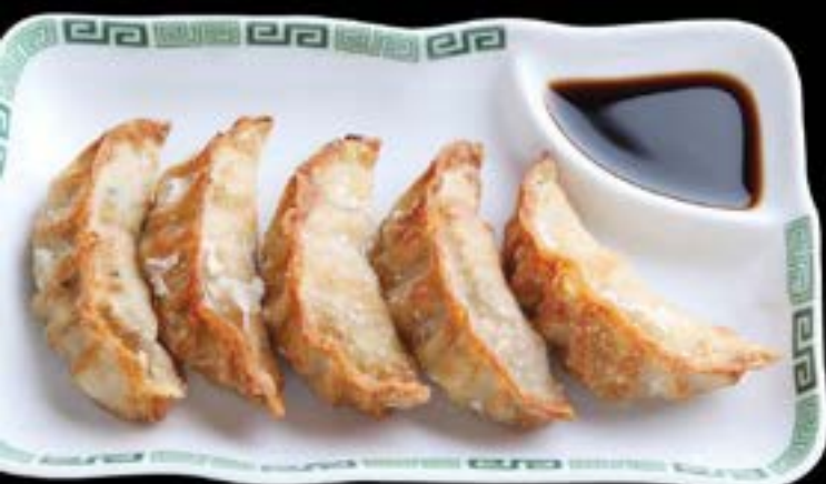
Pan Fried Pork Dumpling with Vinegar Sauce