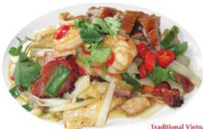
Traditional Vietnamese Stir Fry House Special