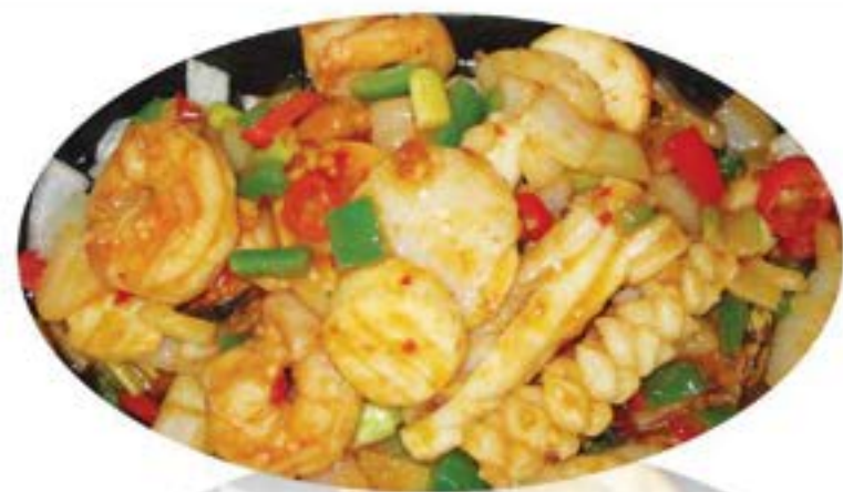
Sizzling Seafood in Garlic & Chilli Sauce