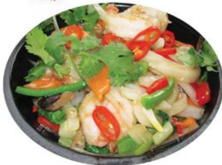
Stir Fried King Prawns in Claypot

Some of our dishes contain ingredients which some people may have a reaction to. Please inform our staff before ordering if you suffer from any food allergies. We will do our best to advise you.