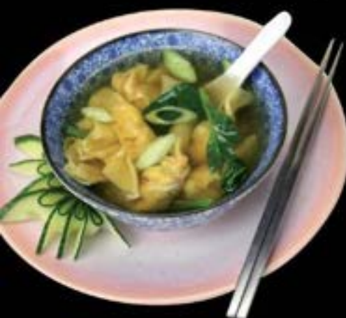
Won Ton Soup

Some of our dishes contain ingredients which some people may have a reaction to. Please inform our staff before ordering if you suffer from any food allergies. We will do our best to advise you.