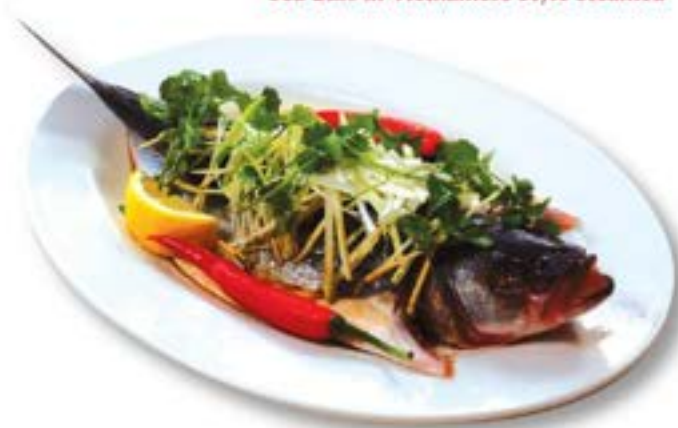
Sea Bass in Vietnamese Style Steamed

Some of our dishes contain ingredients which some people may have a reaction to. Please inform our staff before ordering if you suffer from any food allergies. We will do our best to advise you.