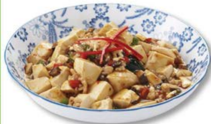
Braised Diced Bean Curd with Minced Pork in Hot Chilli Sauce

Some of our dishes contain ingredients which some people may have a reaction to. Please inform our staff before ordering if you suffer from any food allergies. We will do our best to advise you.